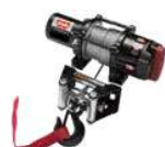
3,000 LB. PROVANTAGE WINCH KIT (3436-037)