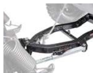
STANDARD PLOW NEXT GEN PUSH FRAME & MOUNT KIT (2436-534)