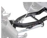
STANDARD PLOW NEXT GEN PUSH FRAME & MOUNT KIT (2436-534)