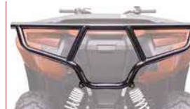
REAR BUMPER (2436-518)