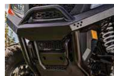
FRONT BUMPER (2436-192)