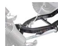
STANDARD PLOW NEXT GEN PUSH FRAME & MOUNT KIT (2436-534)